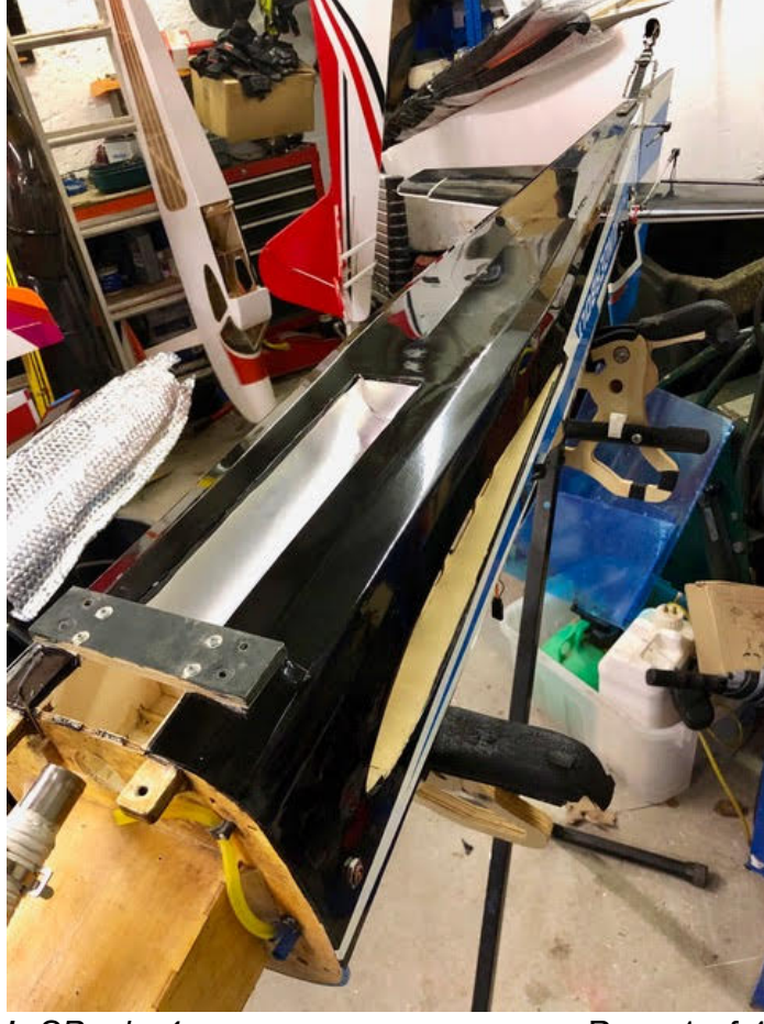
Ron's SBach, 4