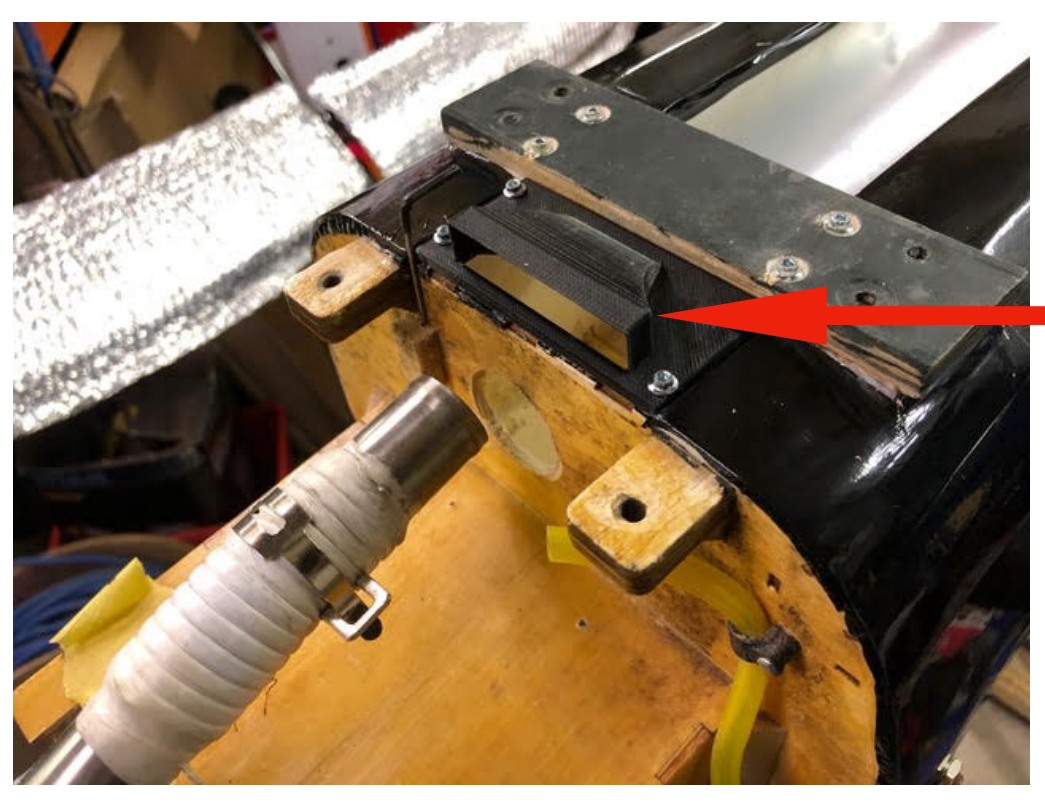
And fitted to force cooling air down through the can tunnel.