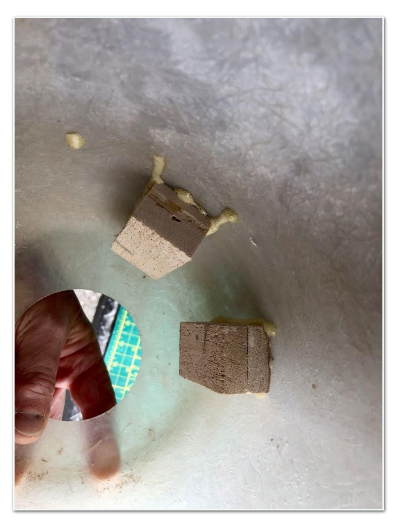
The blocks will be cut down later.