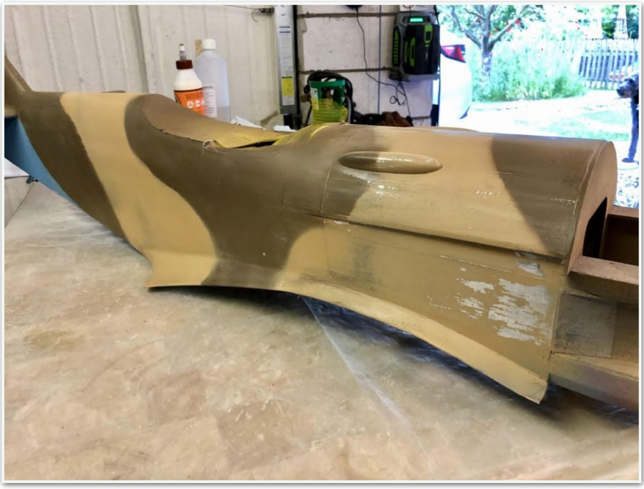
Lavochkin LA-7 resurrection